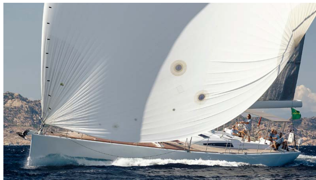
82ft JFA "IKIGAI"