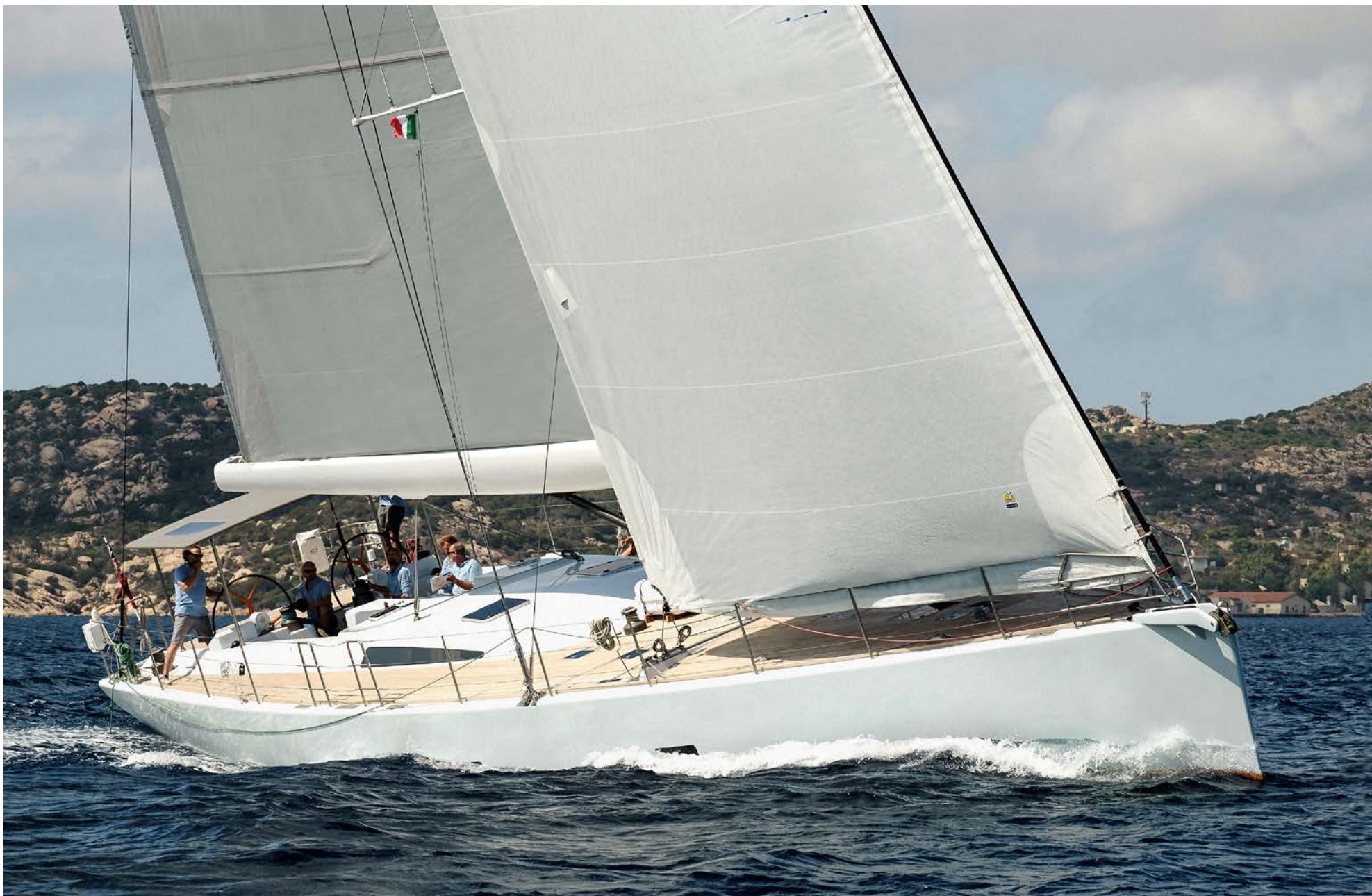
82ft JFA "IKIGAI"