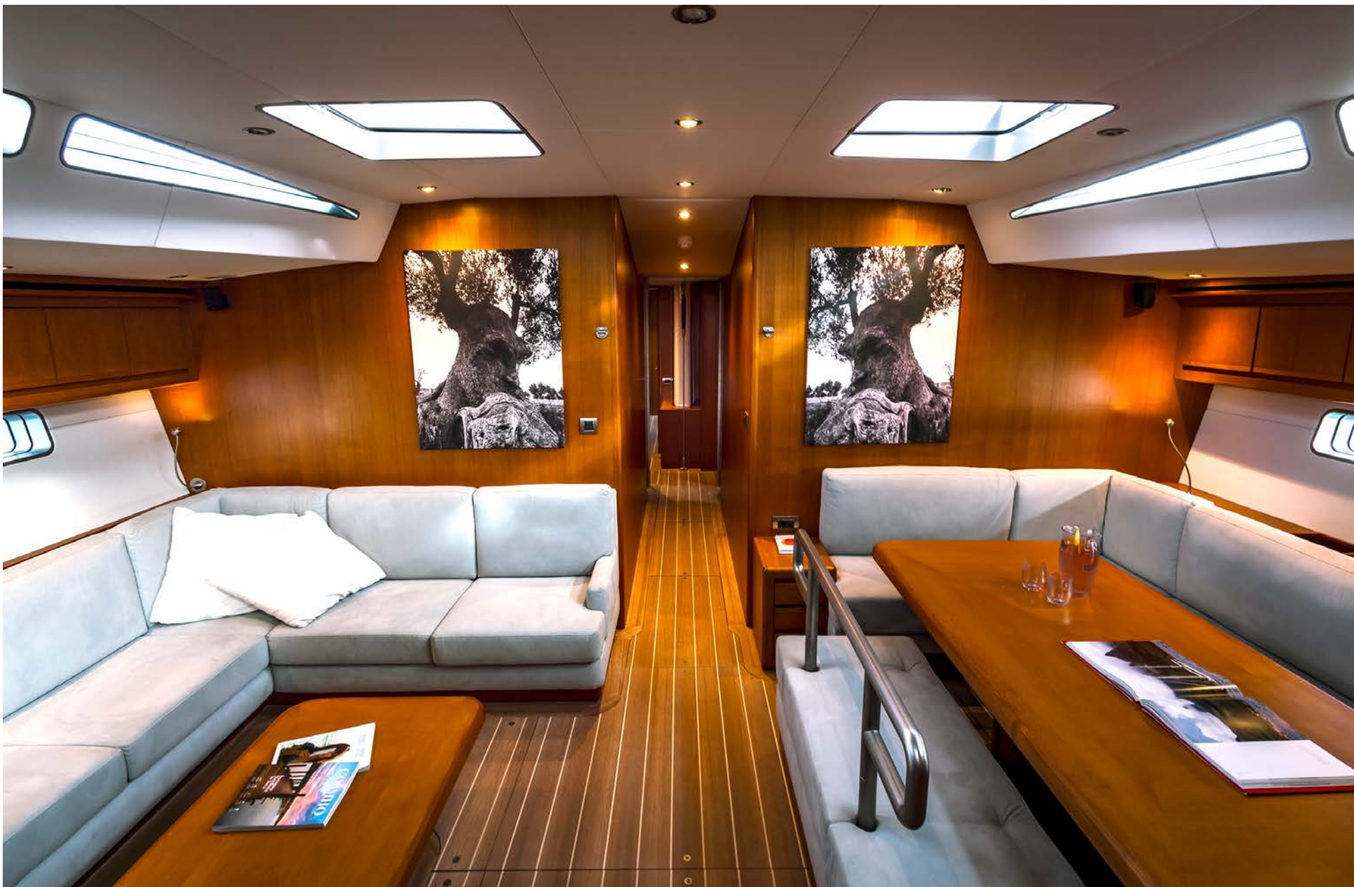
82ft JFA "IKIGAI"