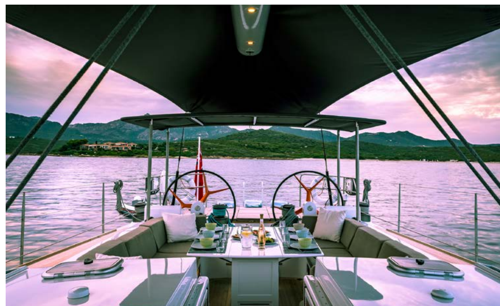
82ft JFA "IKIGAI"