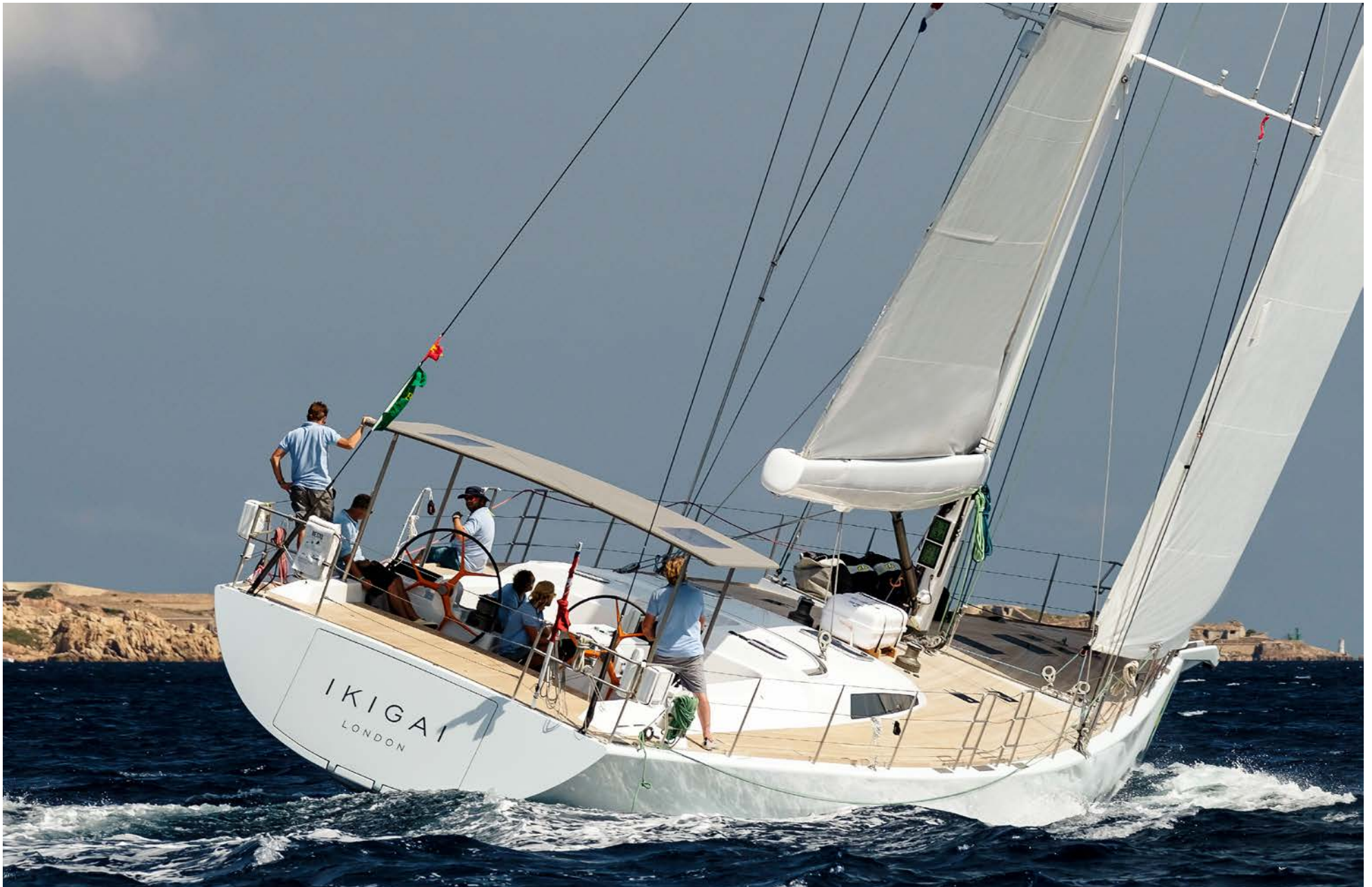
82ft JFA "IKIGAI"