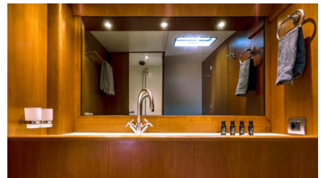
82' JFA "IKIGAI"