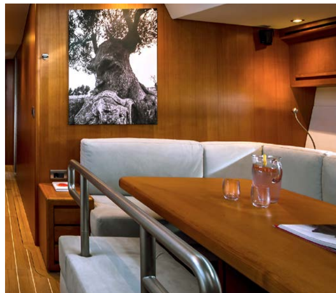
82ft JFA "IKIGAI"