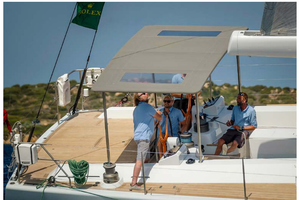
82ft JFA "IKIGAI"