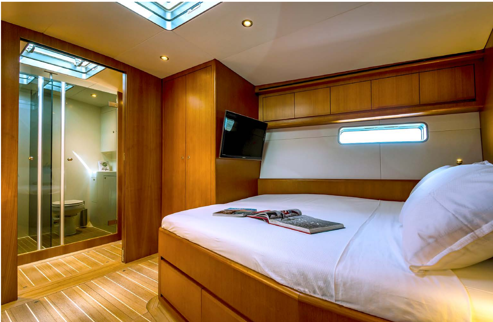
82' JFA "IKIGAI"