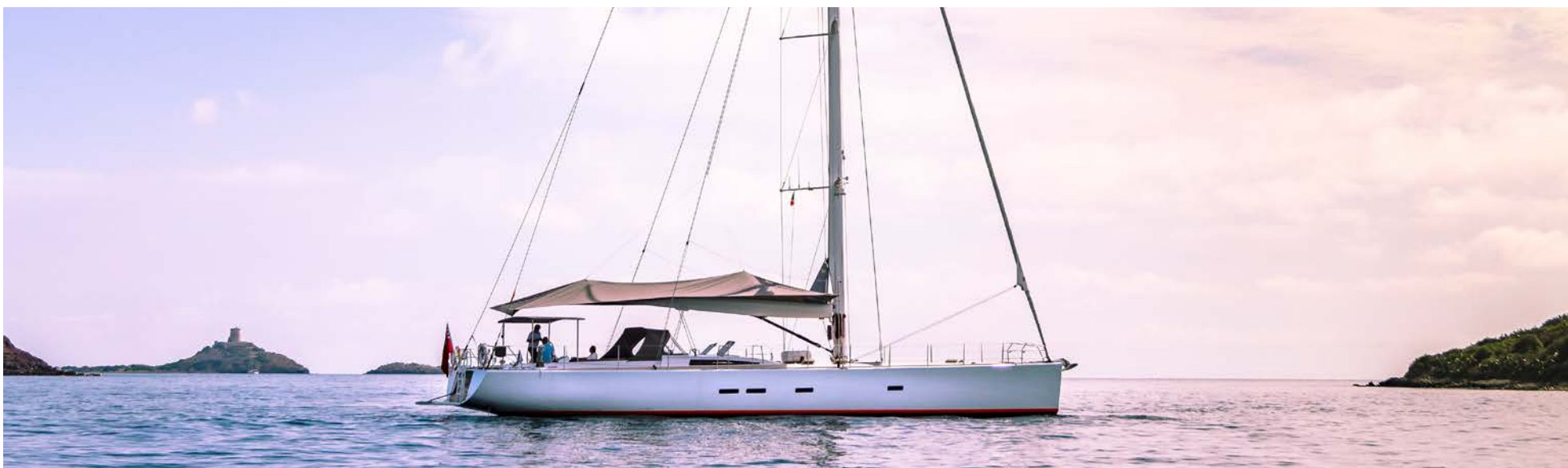
82ft JFA "IKIGAI"