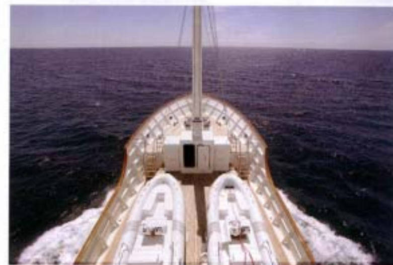
Tenders are deployed from well deck