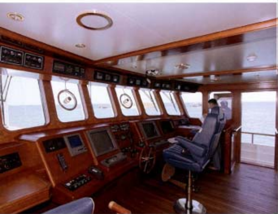
Wheelhouse, left: Again the emphasis is on generous allocation of space