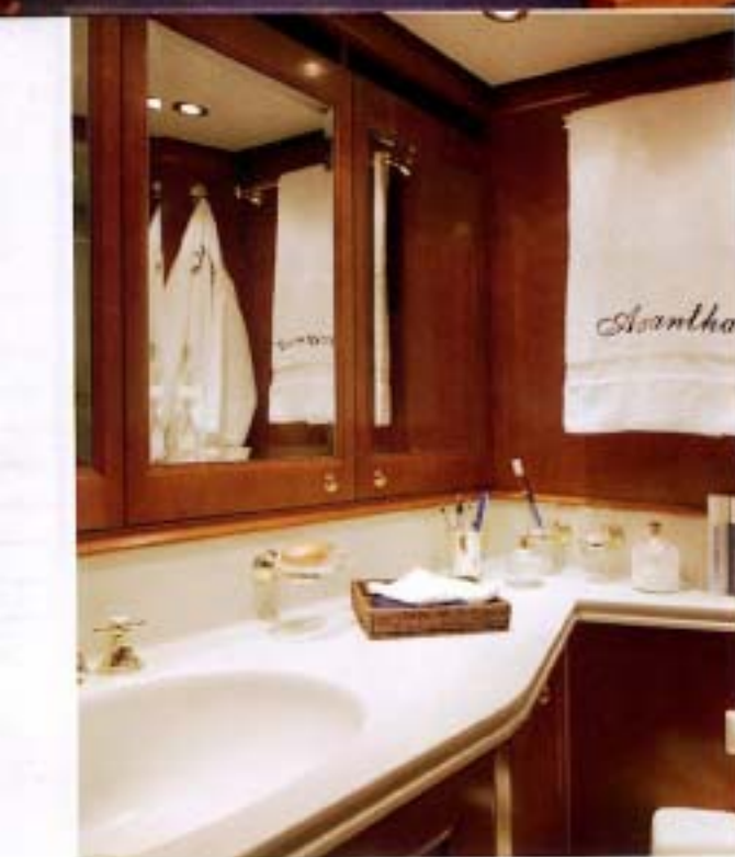
Sound level tests in the owner's suite recorded at only 38 dB

Their access to machinery spaces and other work stations avoids guest areas, which are well isolated from the crew's quarters, engine room, galley, pantry and service rooms. A nod to tradition is seen in the teak decking and in the foredeck where there is a crane concealed in the mast and close by a deep hold for stowage.