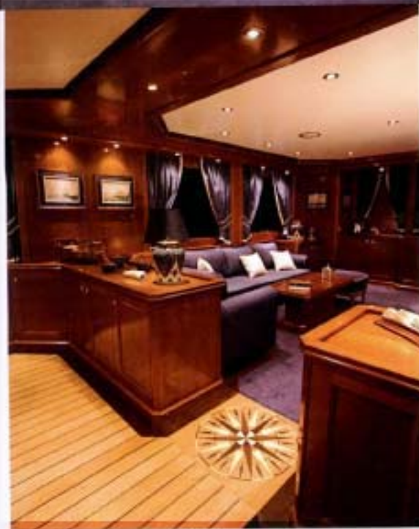
The saloon and other interiors convey sense of comfort without ostentation