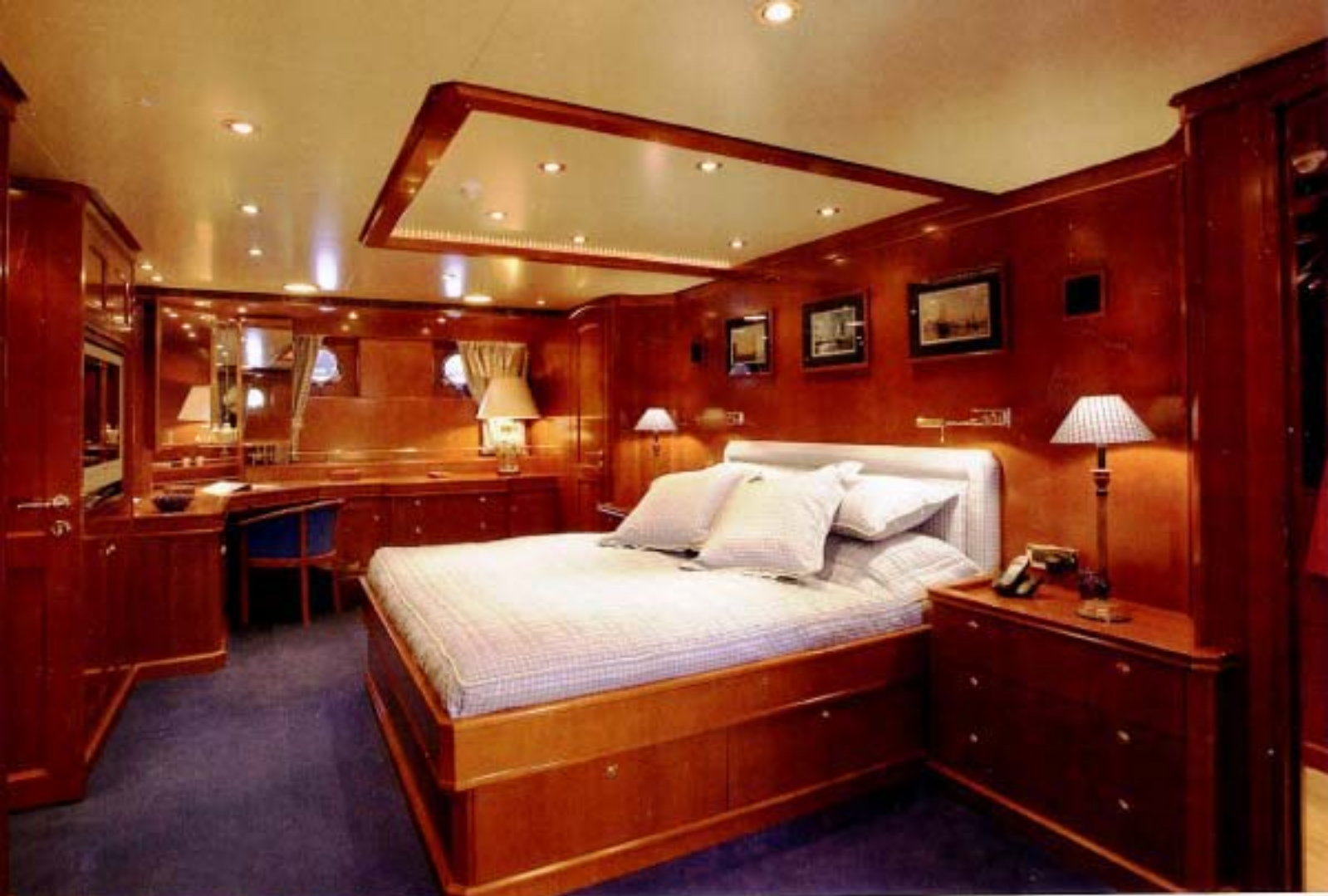
High ceilings distinguish guest cabins, below